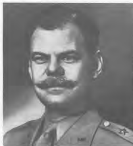
COL. LEON W. JOHNSON

The fifth Second Air Division Medal of Honor recipient is Lt. Col. Leon R. Vance — 489th Bomb Group (pilot), "Missouri Sue" — 5 June 1944 mission to Wimereaux, France, posthumous.