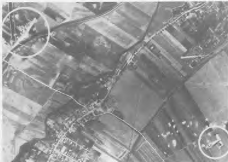
Results of an explosion in the fuel tanks. The forward section is upper left and the tail section is lower right, just prior to impact.

"At 0700, the 852nd Squadron formed with the other Squadrons of the 491st Bomb Group and headed east to join the other Groups of the 14th Combat Wing. A bright