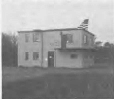
Seething (448th BG) Control Tower, courtesy Patricia Everson, 448th BG Collection. (See "Letters")

During the writer's visit to England in 1989 to help with arrangements for the 2ADA Convention in Norwich, July 26-31, 1990, we had the opportunity to visit the restored Seething (448th BG) tower and museum. We were all very impressed with this restoration (see photo) and hope that something similar can be accomplished with the Shipdham Tower (see photo).