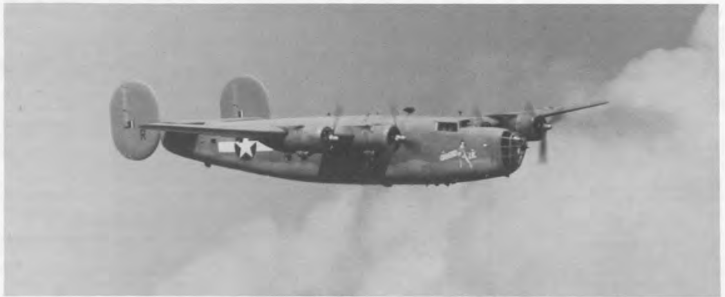
Over Europe 1942