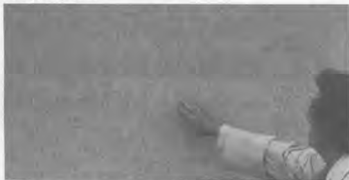
Wall at 8th Air Force Cemetery in Cambridge, England