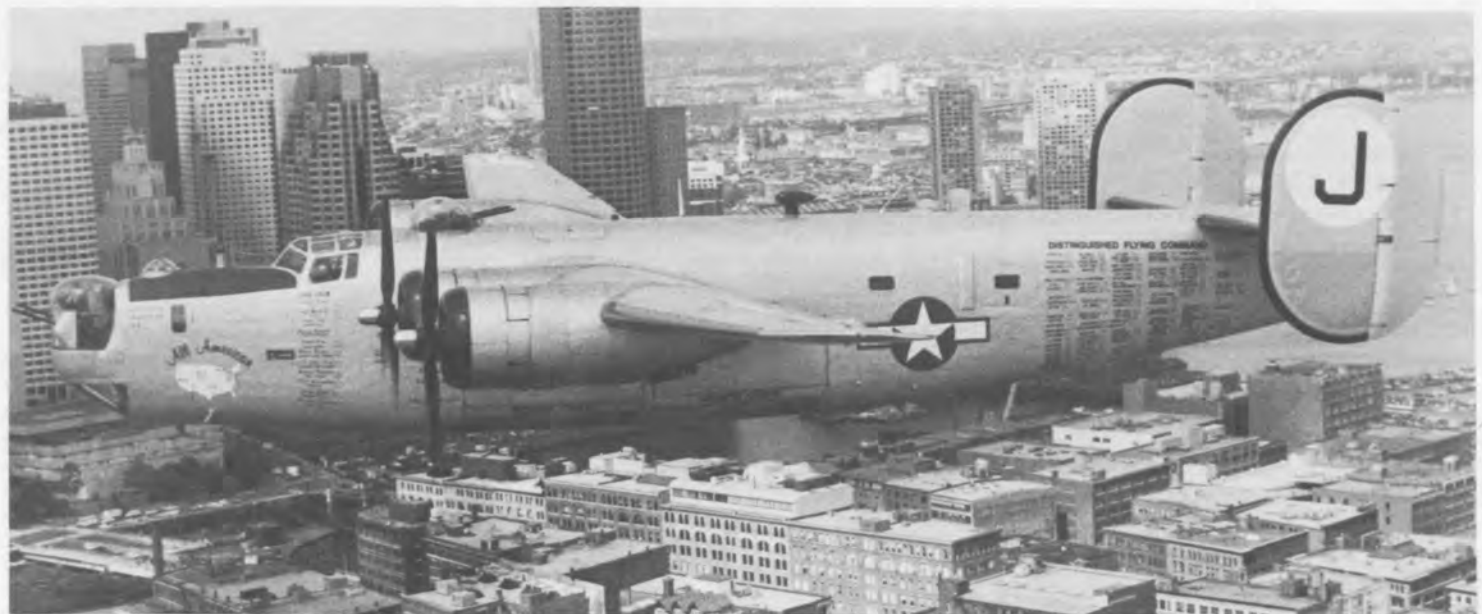
Over Boston 1992