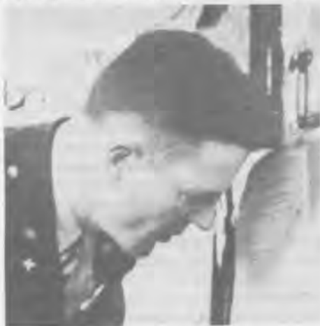
LT. COL. ADDISON M. BAKER

Leon W. Johnson served as Commanding General, 14th Combat Bomb Wing, Second Bomb Division, later Second Air Division, United States Air Force in Europe to June 1945. Gen. Johnson resides in McLean, VA.